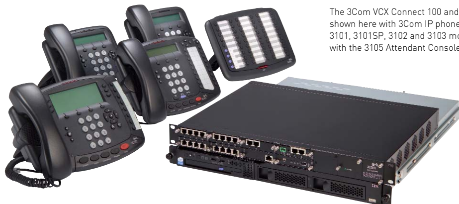
The 3Com VCX Connect 100 and 200 platform are shown here with 3Com IP phones, including the 3101, 3101SP, 3102 and 3103 models, as well as with the 3105 Attendant Console.

Standard VCX Connect features allow calls to be made using multimedia devices such as SIP-based video phones or software applications such as the 3Com Convergence Center Client that offers a rich, integrated set of communications capabilities—including instant messaging, voice, video