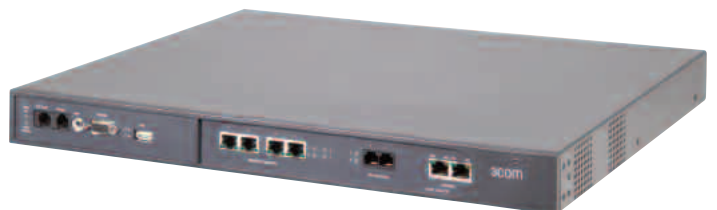
Standards-based 3Com V3001 Analog platforms offer a comprehensive set of features, all in a compact form factor for particularly cost-effective and practical deployment.

SIP support unlocks access to advanced software that optimizes the productivity-enhancing benefits of VoIP technology and facilitates employee communications with collaborative tools such as IP Messaging and IP Conferencing applications.